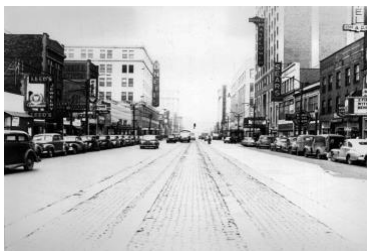
Vintage Akron 1947

The original vision of Harvey S. Firestone was to create a family friendly community where people could live in peace. Because of job outsourcing, Firestone Park has evolved to a