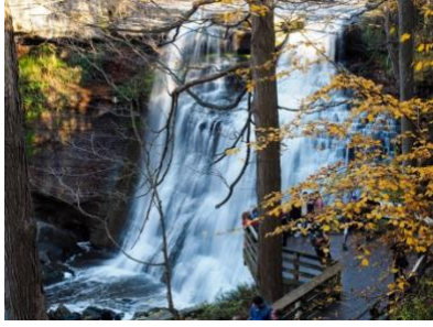
Cuyahoga Valley National Park

Akron boasts excellent health care systems including Cleveland Clinic Akron General, Akron Children's Hospital, and Summa Health Systems, all are complete with assistance programs for those with financial needs. That care extends through parachurch organizations like Truly Reaching You, Rahab Ministries, YWAM Akron and Akron Pregnancy Services.