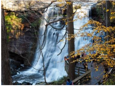
Cuyahoga Valley National Park

Akron boasts excellent health care systems including Cleveland Clinic Akron General, Akron Children's Hospital, and Summa Health Systems, all are complete with assistance programs for those with financial needs. That care extends through parachurch organizations like Truly Reaching You, Rahab Ministries, YWAM Akron and Akron Pregnancy Services.