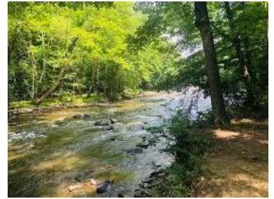
Chuckery Trail Loop Cascade Valley

Plans are in the works for attracting families to once popular areas of the community with new