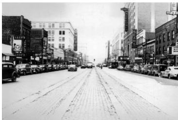
Vintage Akron 1947

The original vision of Harvey S. Firestone was to create a family friendly community where people could live in peace. Because of job outsourcing, Firestone Park has evolved to a